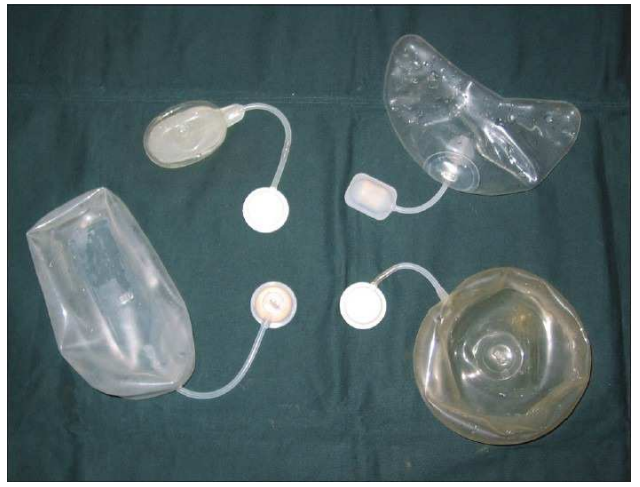
Figure 3: Different types of tissue expanders [15]