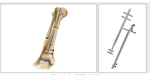
Figure 2: ISKD [10]