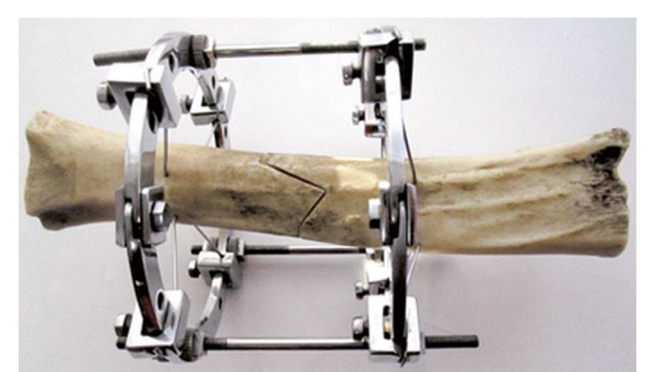
Figure 1: Ilisarov apparatus [11]

The highest efficacy of expansion of solid tissues has been demonstrated in cases such as congenital diseases, pathological growth (nannism), asymmetry, bone loss, prolongation of bones, mandible, trauma.