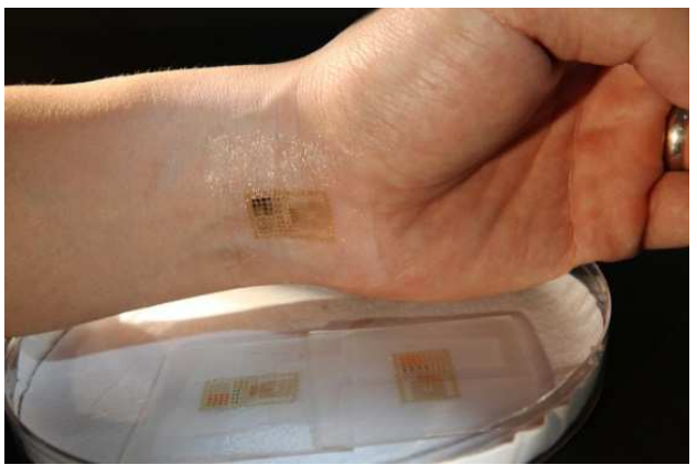
Figure 2 Smart tatoos [11]

twisting of the skin (Figure 2) [10]. These microelectronics, which are thinner than human hair and water-resistant, could be used to monitor the electrical signals produced by heart, brain and muscle without irritation (Figure 3).