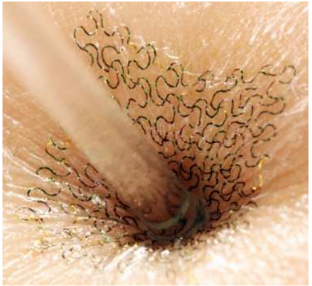
Figure 3 The circuits' filamentary serpentine shape allows them to bend, twist, scrunch and stretch while maintaining functionality [12]

Applications are extensive. Tattoos could be used to monitor heart arrhythmias, sleep disorders and cardiac activity in premature babies, stimulating muscles. Other detectors, transmitters and receivers could be attached to the tattoo. Currently, bioengineers are working on producing a small battery powered by solar cells or a wireless transmitter. They hope that one day they will be able to interpret chemical information from the skin [1, 13].